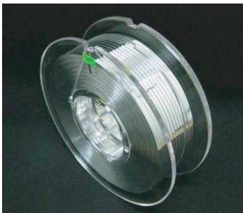
Winding / Spool = 100~300m / No.120 (It changes depending on the ribbon size.)