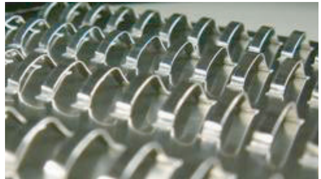
Ribbon Size: w2.0×t0.2 (mm) Loop Length: 10mm